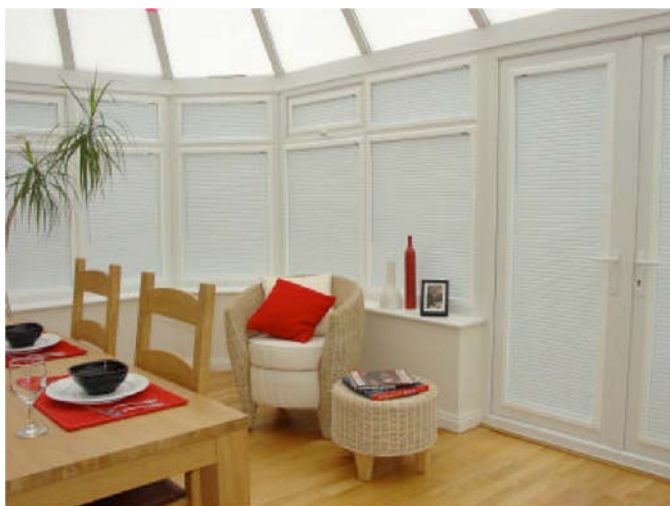
Perfect Fit with Venetian Blinds to the Window Frame