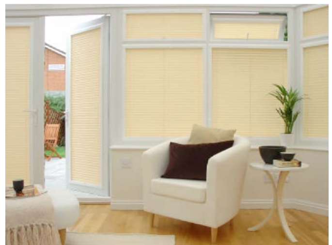
Perfect Fit with Pleated Blinds